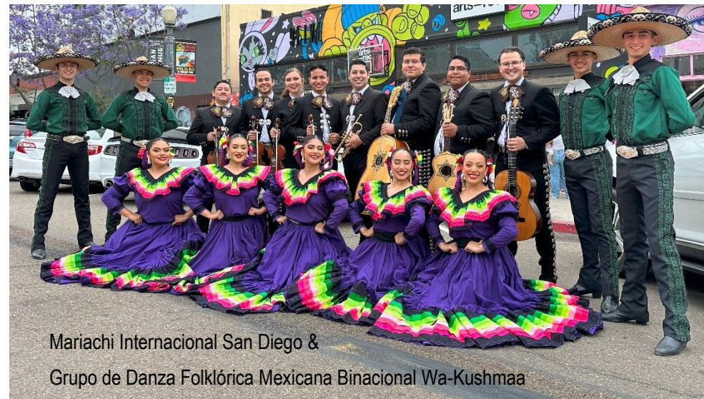
Mariachi Internacional San Diego & Grupo de Danza Folklórica Mexicana Binacional Wa-Kushmaa