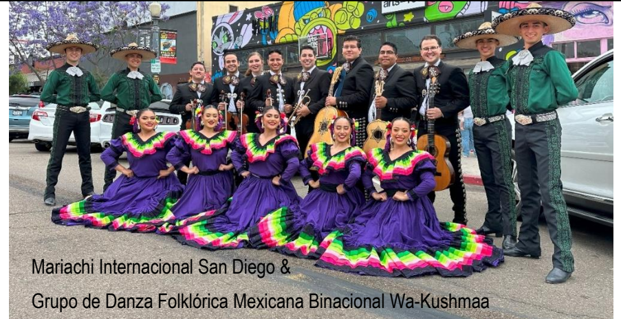
Mariachi Internacional San Diego & Grupo de Danza Folklórica Mexicana Binacional Wa-Kushmaa

Best-Decorated Table: An award will be presented to the best-decorated table, as judged by members.